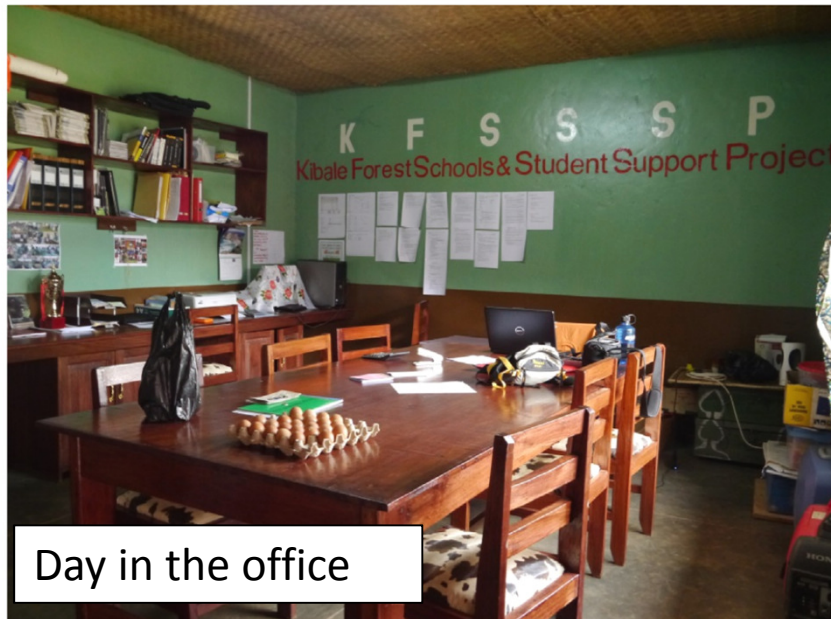
Day in the office