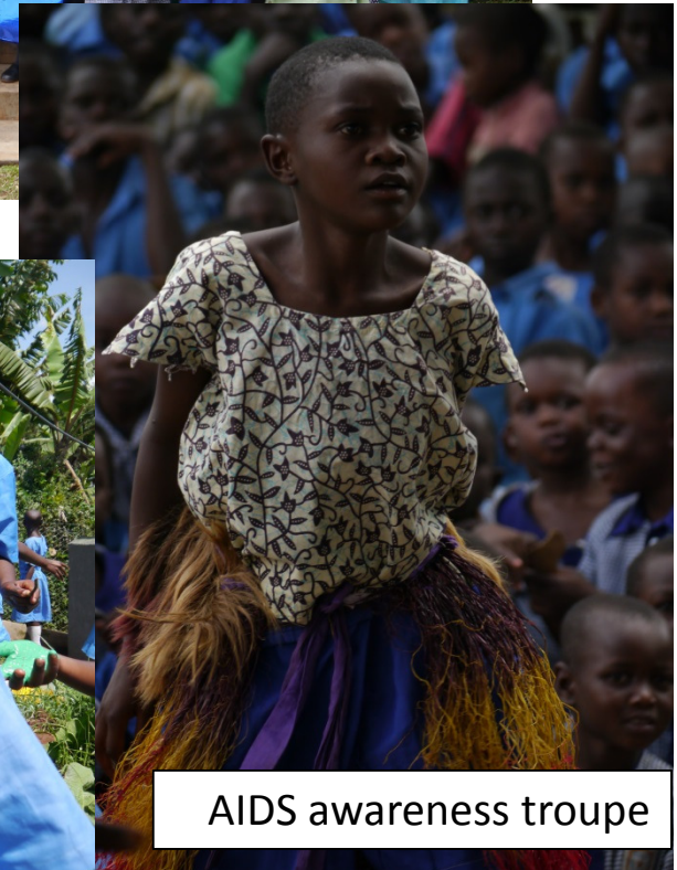
AIDS awareness troupe