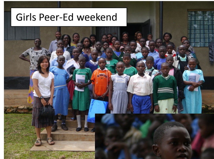
Girls Peer-Ed weekend