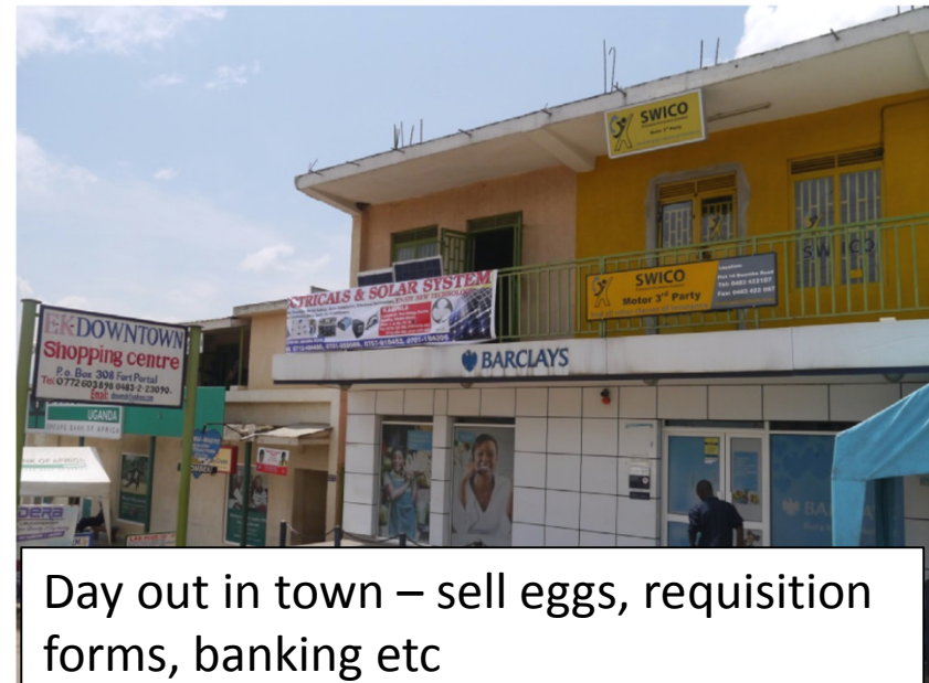
Day out in town – sell eggs, requisition forms, banking etc