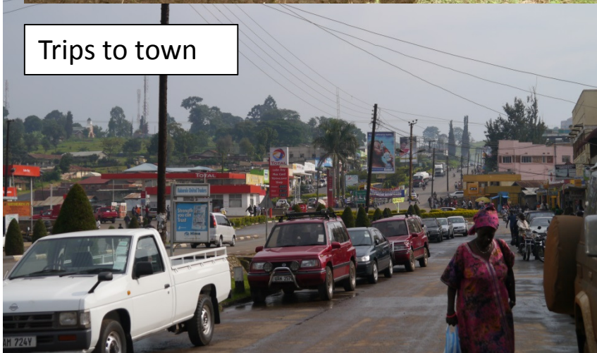
Trips to town