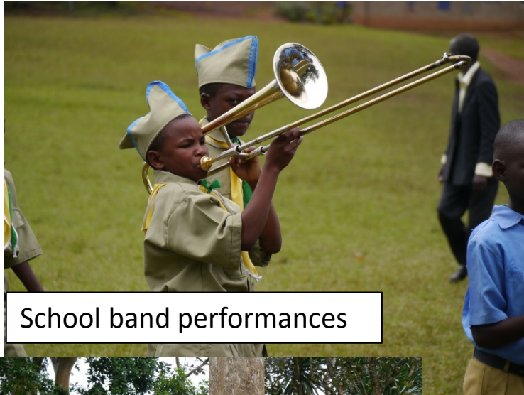
School band performances